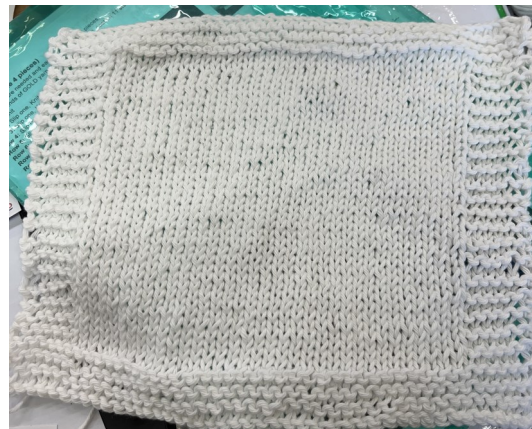
Pattern 2 Stocking Stitch

Join with sl st in first dc. Fasten off.